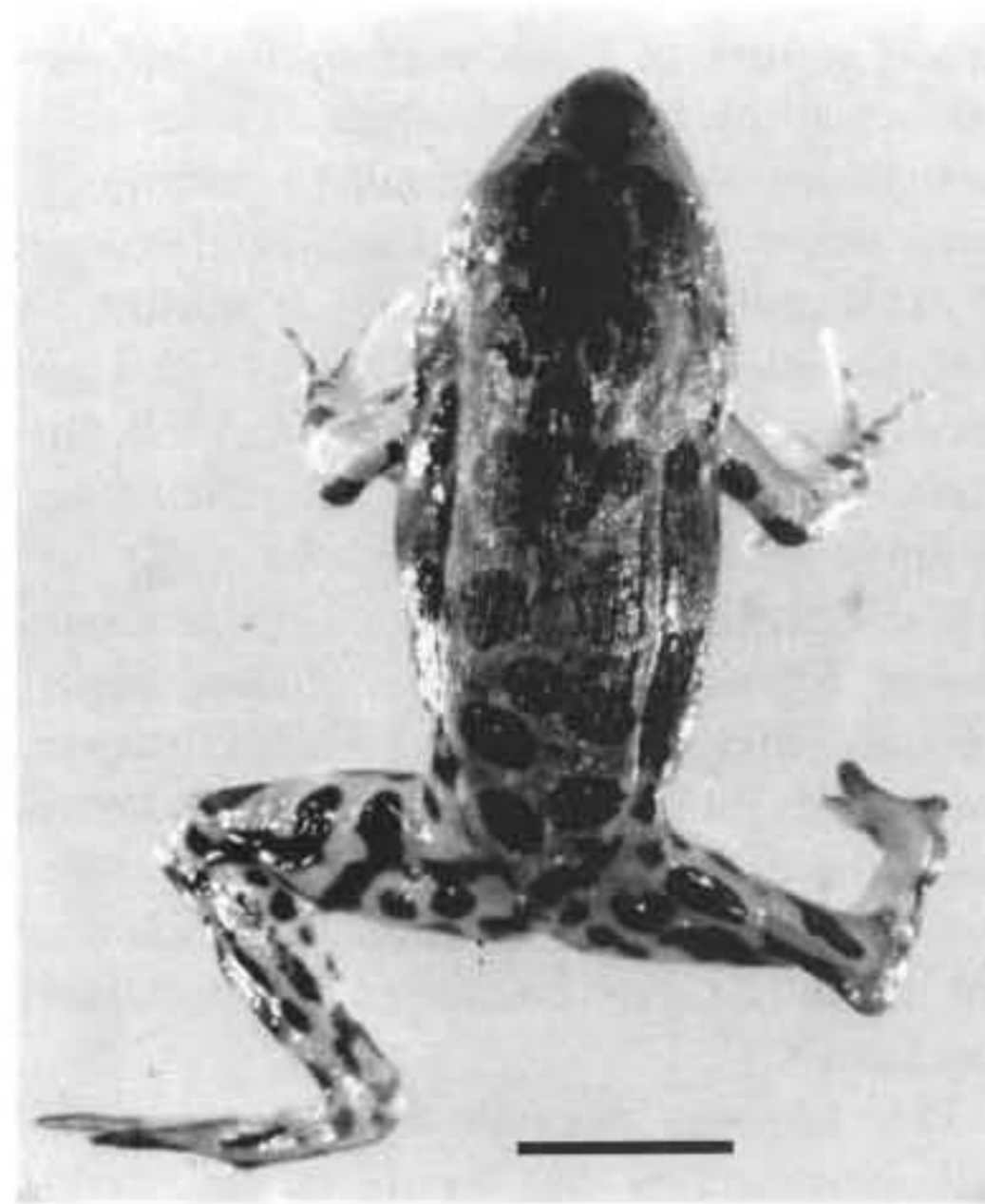
FIGURE 2. Recently metamorphosed Rana pipiens with ectromelia, ectrodactyly, and a knee anteversion of the right hindlimb. Bar = 1 cm.

Ectromelic individuals were characterized by the absence of one or more parts of the limb (Figs. 1 and 2). The tarsal bones, tibiofibula, and femur were sometimes partially or completely missing. The affected leg was usually marked by muscular atrophy and occasionally by bony excrescences. Ectrodactyly (Figs. 1 and 2) was represented by the lack of one or more toes or parts of toes (phalanges, metatarsal bones). Missing digits varied from one to five on the affected foot. Both conditions were polymorphic and occurred on the right or the left side of the body. Bilateral deformities without symmetrical pattern were also observed among some anurans. In general, the proximal part of the remaining leg was clinically functional. On microscopic examination, the affected limbs had epiphysial hypoplasia and segmental hypoplasia of the diaphysis of the femur and tibiofibula bones. Partial or complete agenesis of the tarsus, metatarsal bones and phalanges was also usually present. Epiphyseal cartilage proliferation was observed in one individual affected by a knee anteversion (Fig. 2). Inflammatory changes, parasites, and neoplastic altera-